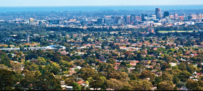
Panorama view of Adelaide from Mt Lofty